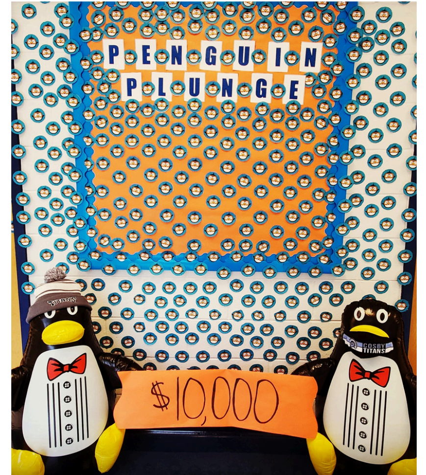
COSBY HS PENGUIN WALL

Looking for some more ideas? Visit our school fundraising page for more ways to include your classmates and reach your fundraising goals! Click HERE!