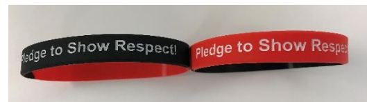
Wristbands for Student Leaders

Visit https://tinyurl.com/r-wordva to order your free supplies today and http://www.spreadtheword.global/ for additional resources.