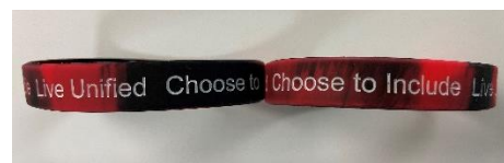
Wristbands for Student Leaders

Visit https://tinyurl.com/ChooseToIncludeVA to order your free supplies today!