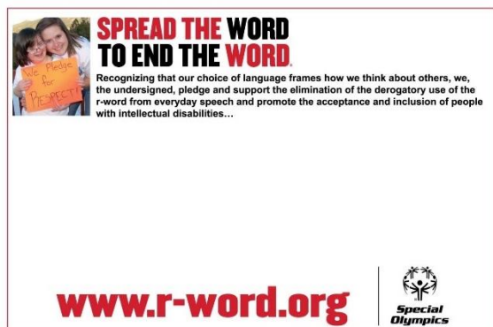
Pledge Banner, 36" x 54"

Too often, people speak without thinking about the effects – even if it's not meant in a mean way. The Spread the Word to End the Word campaign invites people to pledge to stop saying the R-word as a starting point toward creating more accepting attitudes and communities for all people. Language affects attitudes and attitudes affect actions. Free resources include: