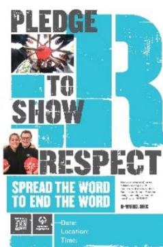
Event Poster, 8.5 x 11