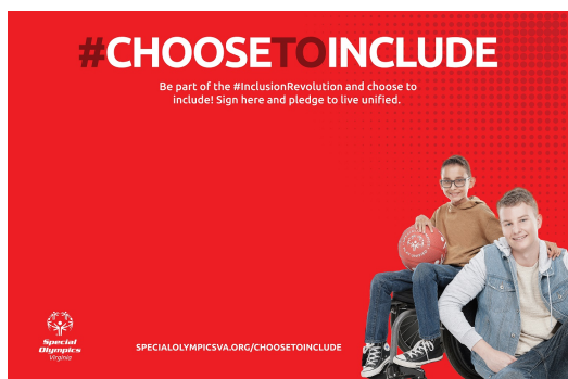
Pledge Banner, 36" x 54"

Special Olympics Virginia offers a school-wide awareness campaign called Choose To Include. Similar to the Spread the Word campaign, students sign a pledge to join the Inclusion Revolution by accepting others with differences. This campaign is appropriate for elementary, middle and high schools. Use your inclusive student leadership team to launch a Choose To Include campaign at your school. Free resources include: